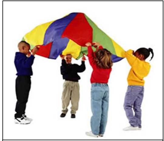
2 small & 2 large parachutes