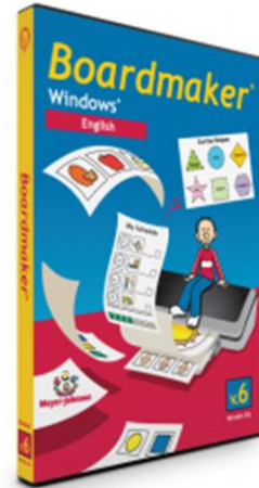
Boardmaker Software (not to be checked out but available for use)