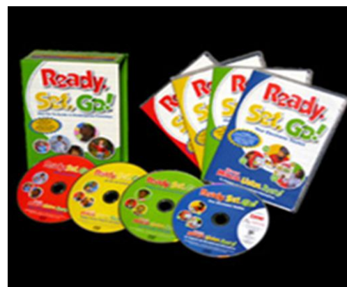
Ready, Set, Go! Kindergarten Transition DVD set