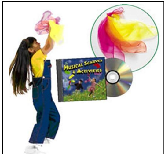
Musical Scarves Activity set