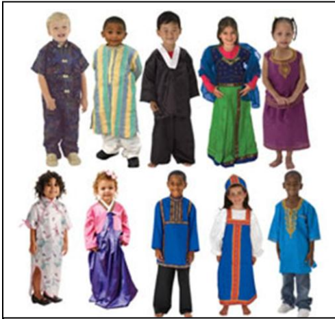
Cultural clothing outfits (included in some kits)