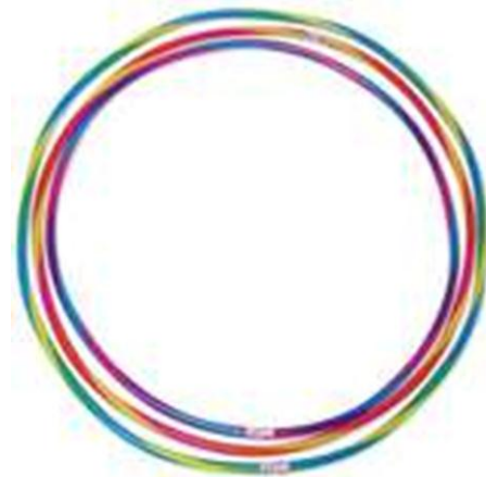
Hula Hoops (outdoor equipment can be reserved for 1 week at a time)