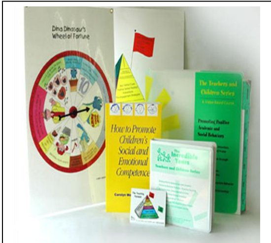
The Incredible Years for Teachers Kit